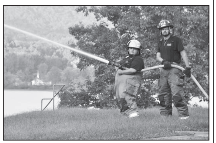
Two Towns County Firefighters training on Oct. 1.